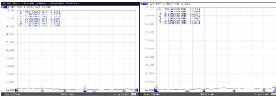
Figure left: Input Return Loss S11 ( [Pin=-30dBm, CW, Load VSWR≤1.2, 25°C]