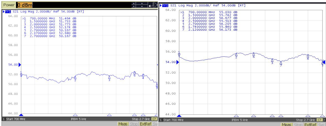
Figure left: Power Gain S21 (Pin=0dBm, Load VSWR≤1.2, 25°C), For reference only.