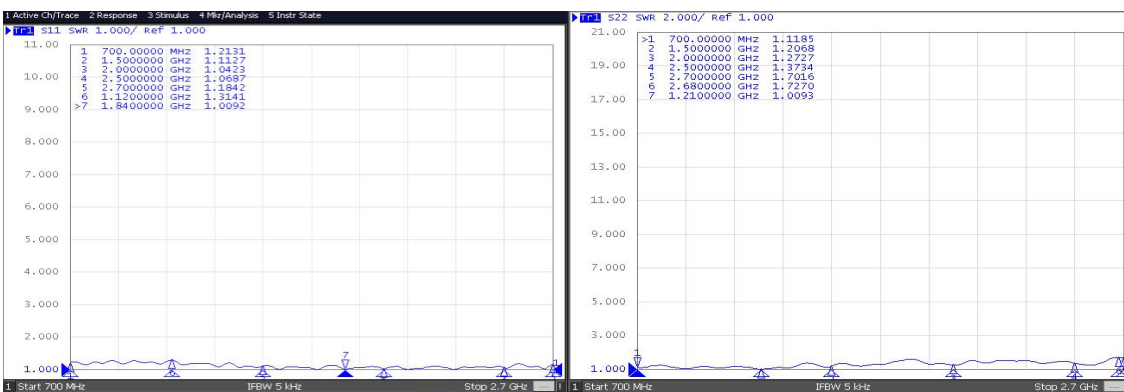
Figure left: Input Return Loss S11 ( [Pin=-30dBm, CW, Load VSWR≤1.2, 25°C]