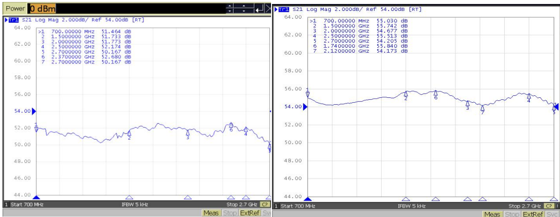
Figure left: Power Gain S21 (Pin=0dBm, Load VSWR≤1.2, 25°C), For reference only.