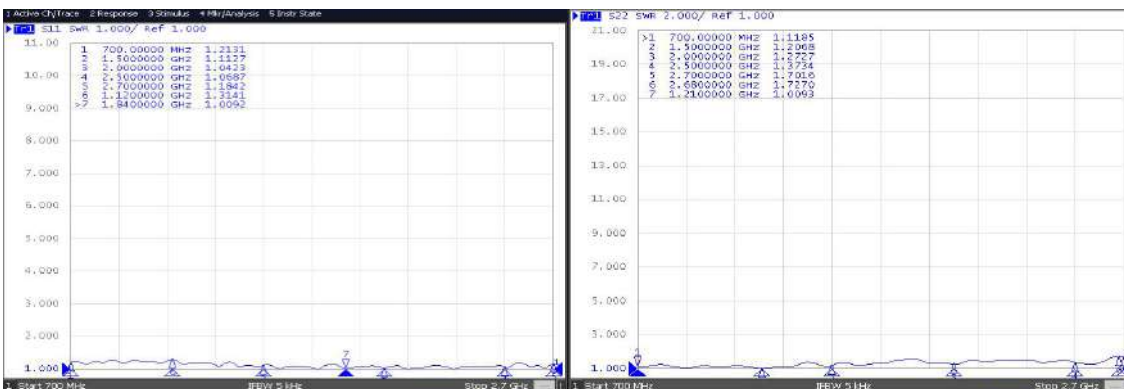
Figure left: Input Return Loss S11 ([Pin=-30dBm, CW, Load VSWR≤1.2, 25°C])