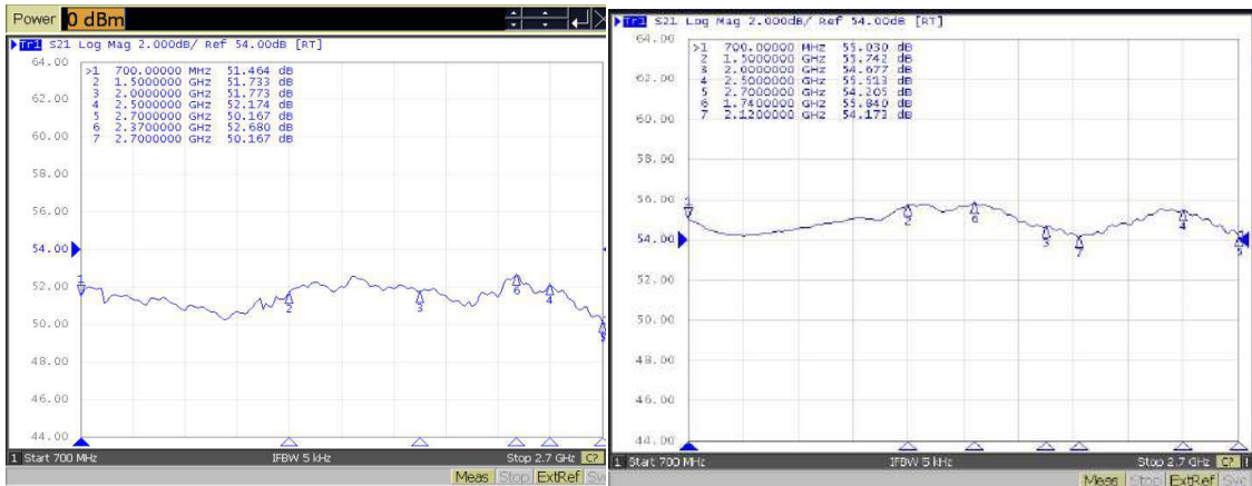
Figure left: Power Gain S21 (Pin=0dBm, Load VSWR≤1.2, 25°C), For reference only.