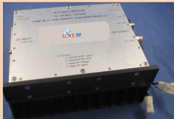
150 watts 75 to 140 MHz 48 VDC